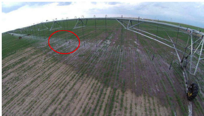
Figure 3 - Pivot Irrigation Nozzle Inspection

2. Irrigation inspection – Managing multiple linear or center pivot irrigation systems is a labor-intensive task — especially for large growers who have many fields spread out across a region. Once crops like corn begin reaching certain heights, mid-season inspections of irrigation nozzles and sprinklers become a hassle, requiring inspectors to wade through crops to find the troubled ones. This is a very time-consuming task that can be done with a small off-the-shelf prosumer camera drone (like the one used to capture Figure 3), but it's best done with professional drones that have camera zoom functionality.