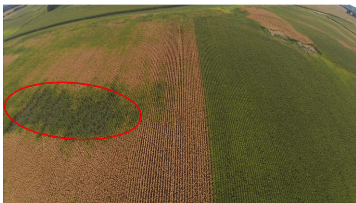
Figure 2 - Simple Crop Scouting Example

1. Simple crop scouting – This involves nothing more than flying a drone over a field to view, capture, and playback color images or HD video, which can deliver a lot of useful information. Rather than make lengthy drives of the entire property to find problem areas, growers can see in a short time the areas that might need attention (see Figure 2). They can then go to that area and investigate further.