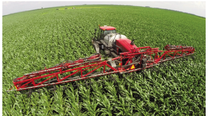
Figure 1 - Variable Rate Applicator

Most of precision agriculture depends on the use of VRT applicators like the one shown in Figure 1 below. Farmers generally apply more agrochemicals on the chance that good weather leads to bumper crop yields. Amounts are determined based on plant requirements. Applications of a remedy over a field are based on a precise GPS- and GIS-based prescription. This typically leads to less usage of expensive inputs. For example, the less N (nitrogen) and pesticides applied, the lower chance that excess N or pesticides get into the environment.